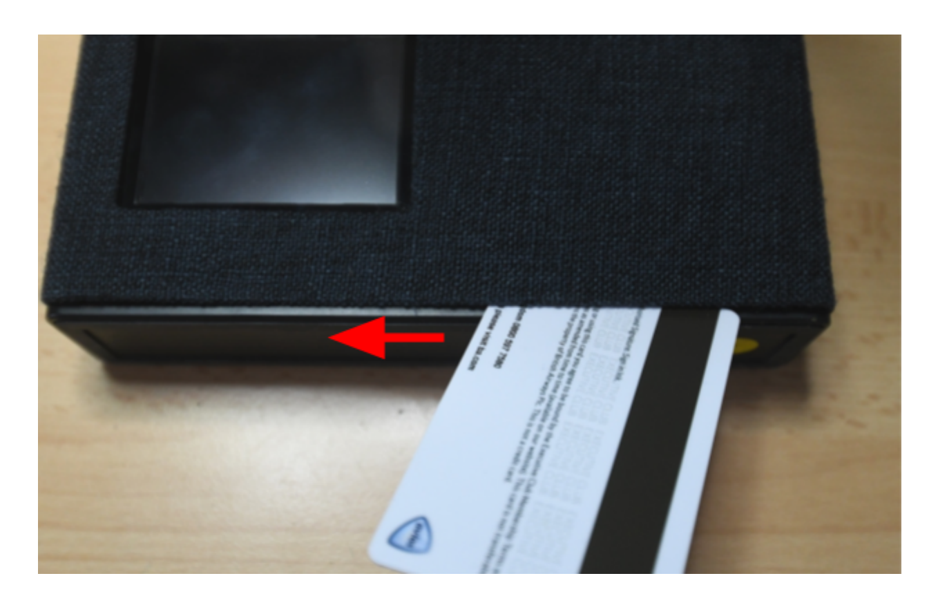
Step 5 - prise away the top edge .

The top edge is a repeat of the bottom edge - but the last clip at the top right of the display is always a bit reluctant. Take your time. If necessary run the credit card around the bottom and top again and approach the last clip from the other side.