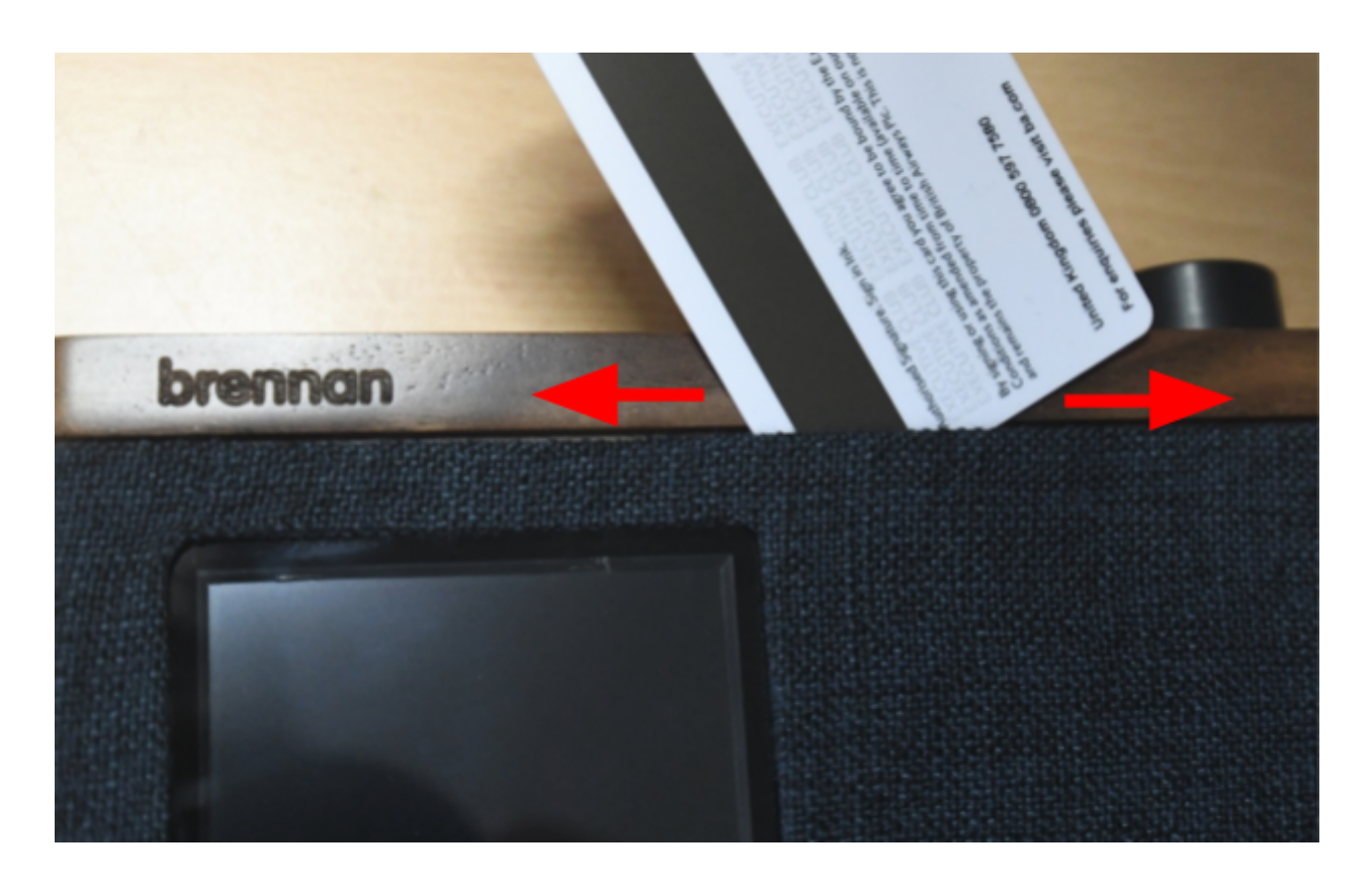
Step 6 - slide the cover off the body and replace SD.

When all the clips have been unclipped the cover will slide off the body. Notice that the cover fits in grooves at the sides. You can now see the micro SD card in the Raspberry Pi at the left side of the bb1.