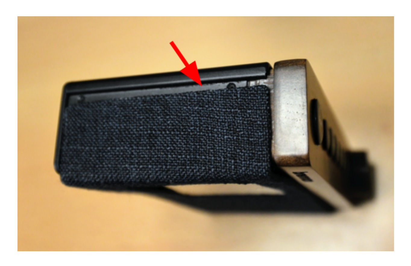
Step 4 - prise away the bottom edge .

The fabric cover is held in place by some locating pillars dotted around and clips near the display. You need to loosen these by running the credit card along the bottom edge. You should insert about 5-8mm and slide it along. You will feel the clips release when you get it right.